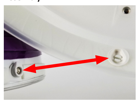
1. Align the Helmet Front Adapter to the indentation on the inside of the FCC Front Adapter.