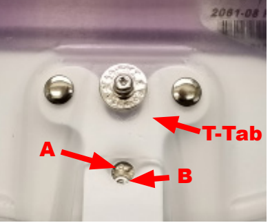
3. Pull the FCC fully down on the Helmet (Squeeze together) to align the FCC T-Tab hole (A) over the Helmet rear Bottom Snap (B).