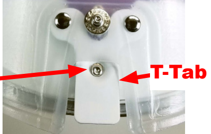
4. Ensure that the T-Tab is fully snapped down on the Helmet rear Bottom Snap (use thumb if necessary to press in place).