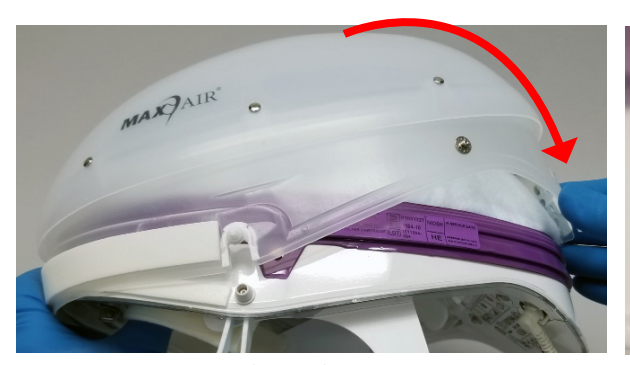
2. Hold the Helmet/Liner/ Filter Cartridge upright by its rear underside with one hand, insert the Helmet Front Adapter into the inside of the FCC Front Adapter, and pull the FCC, back, over and down onto the Helmet.