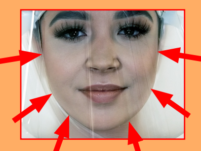
1 Ensure slight tension between Face and Cuff, or use SM size.