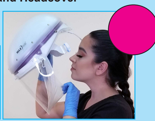
3. Pull top edge of Cuff down and place Chin into Cuff, pull Helmet down onto Head.