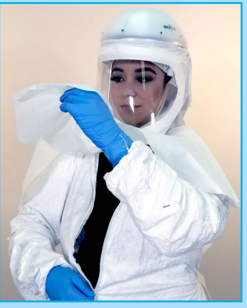
3. FOR DOUBLE SHROUD: Tuck inner Shroud Body inside outer Gown.