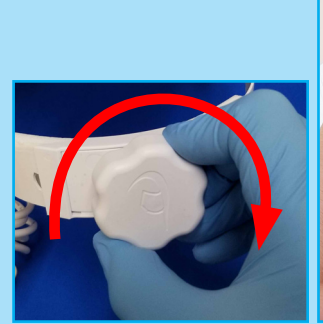
1. Tighten Headband Knob securely comfortable for all activities.