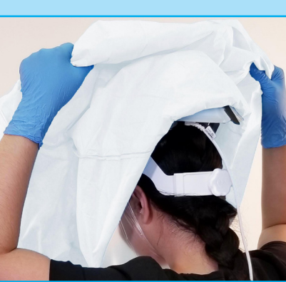
2. SHROUDS ONLY: Pull Shroud Body down over Shoulders.