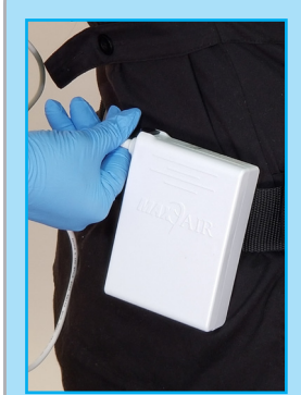
1. Connect Power 2. Loosen Headband Cord to Battery.