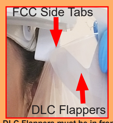
1 DLC Flappers must be in front of FCC Side Tabs

1 Ensure less than one-half inch between Eyebrows and Helmet front bottom so Safety LEDs are easily seen.