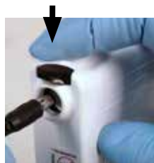
Battery Secure-Lock Pushbutton