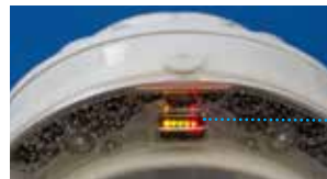
All five LEDs are shown on as is the case during the System Test each time the Helmet is powered on.