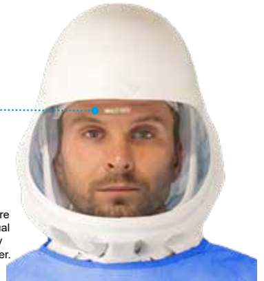
NOTE: LEDs are illustrated; Actual display is only visible to wearer.