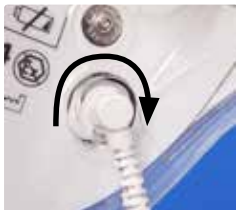
Helmet Turn-Lock Connection