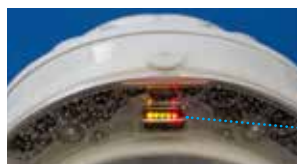
All five LEDs are shown on as is the case during the System Test each time the Helmet is powered on.