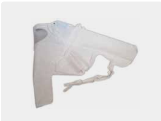
2264-01 ML & SM - SINGLE SHROUDS