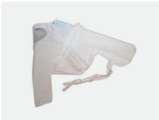
2264-01 ML & SM - SINGLE SHROUDS